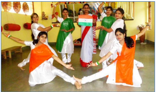
दिव्यांग दिवस पर