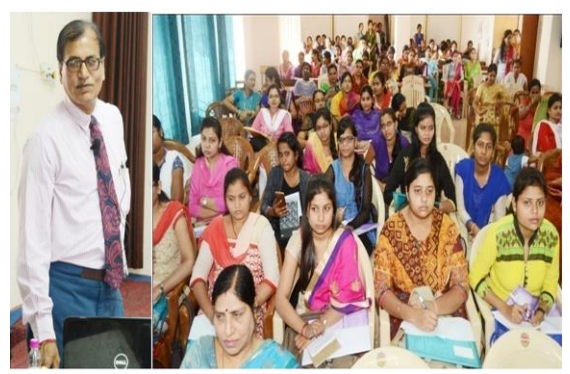
रसायनशास्त्र विभाग द्वारा राष्ट्रीय कार्यशाला