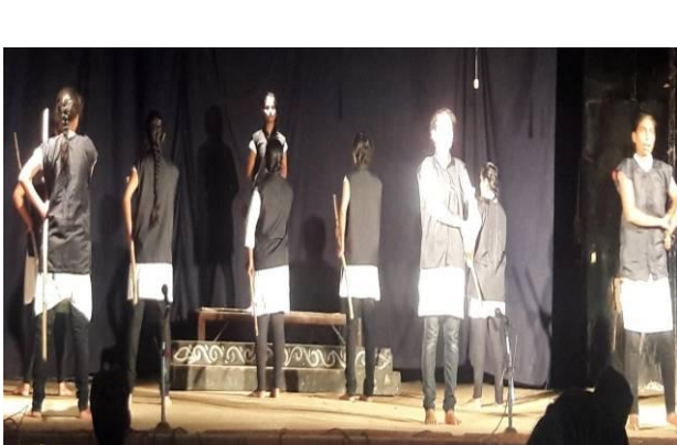
"रहनुमा कौन" नाटक