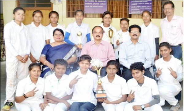
महाविद्यालयीन, क्रीड़ा समिति तथा क्रिकेट टीम प्राचार्य के साथ