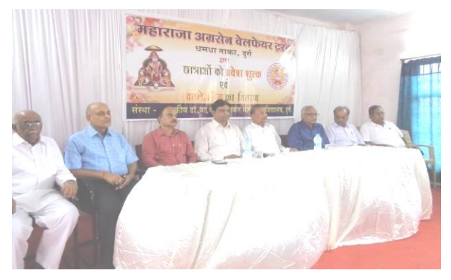
''बालिका शिक्षा'' अग्रसेन वेलफेयर ट्रस्ट