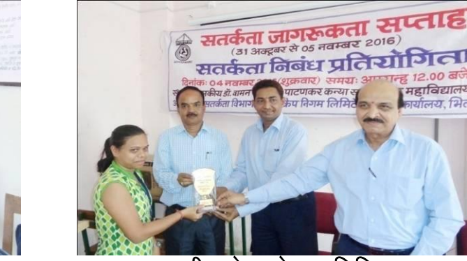
राष्ट्रीय सेवा योजना शिविर