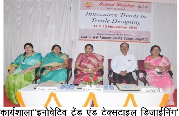
कार्यशाला"इनोवेटिव ट्रेंड एंड टेक्सटाइल डिजाईनिंग"