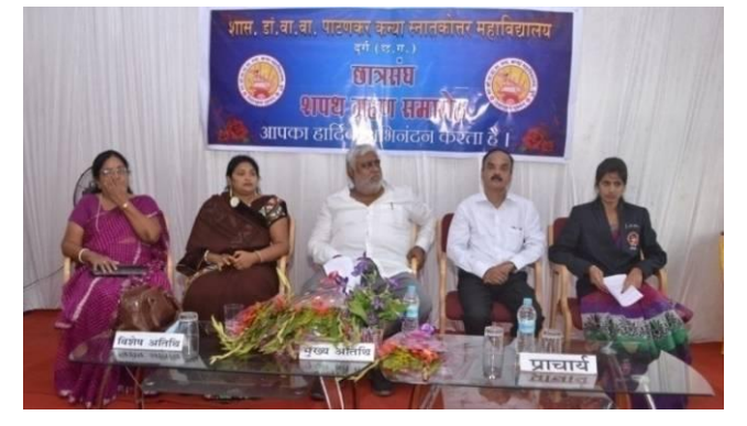
शपथ ग्रहण समारोह