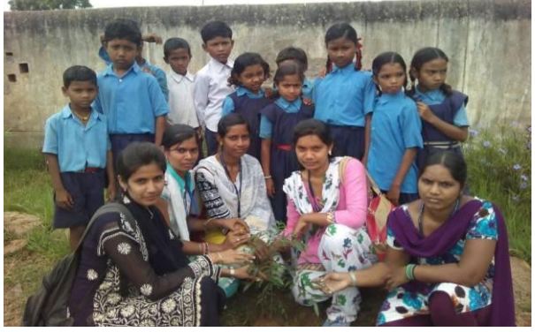
हरियर छत्तीसगढ़ अभियान