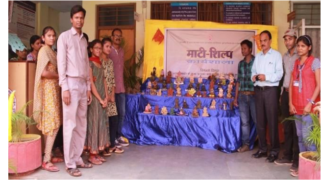
''माटी शिल्प पर कार्यशाला