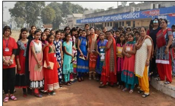
''देवभोग दुग्ध संयंत्र'' कुम्हारी का भ्रमण