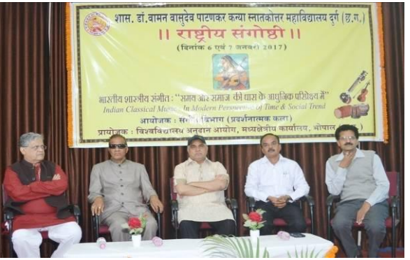
भारतीय शास्त्रीय संगीत पर राष्ट्रीय संगोष्ठी