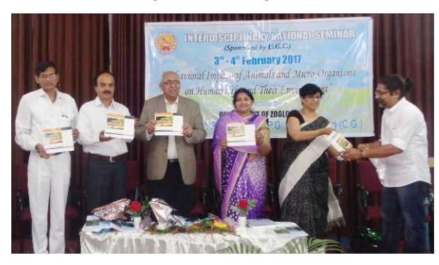
प्राणीशास्त्र विभाग द्वारा राष्ट्रीय संगोष्ठी