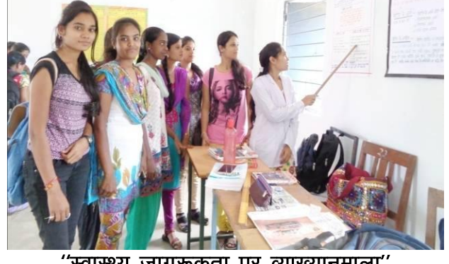
"स्वास्थ्य जागरूकता पर व्याख्यानमाला"