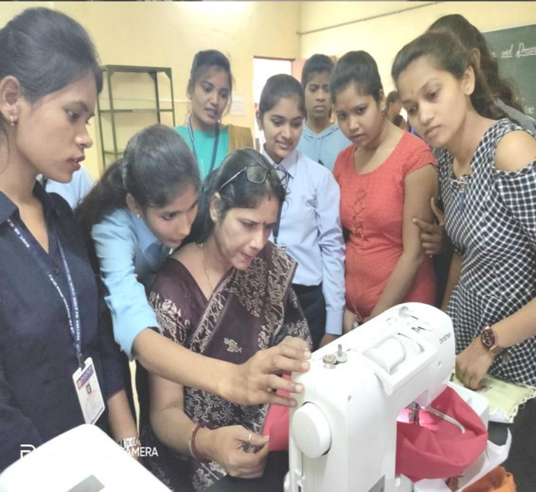
48MP AI QUAD CAMERA