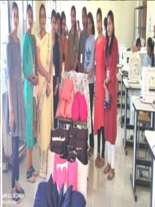
48MP AI QUAD CAMERA