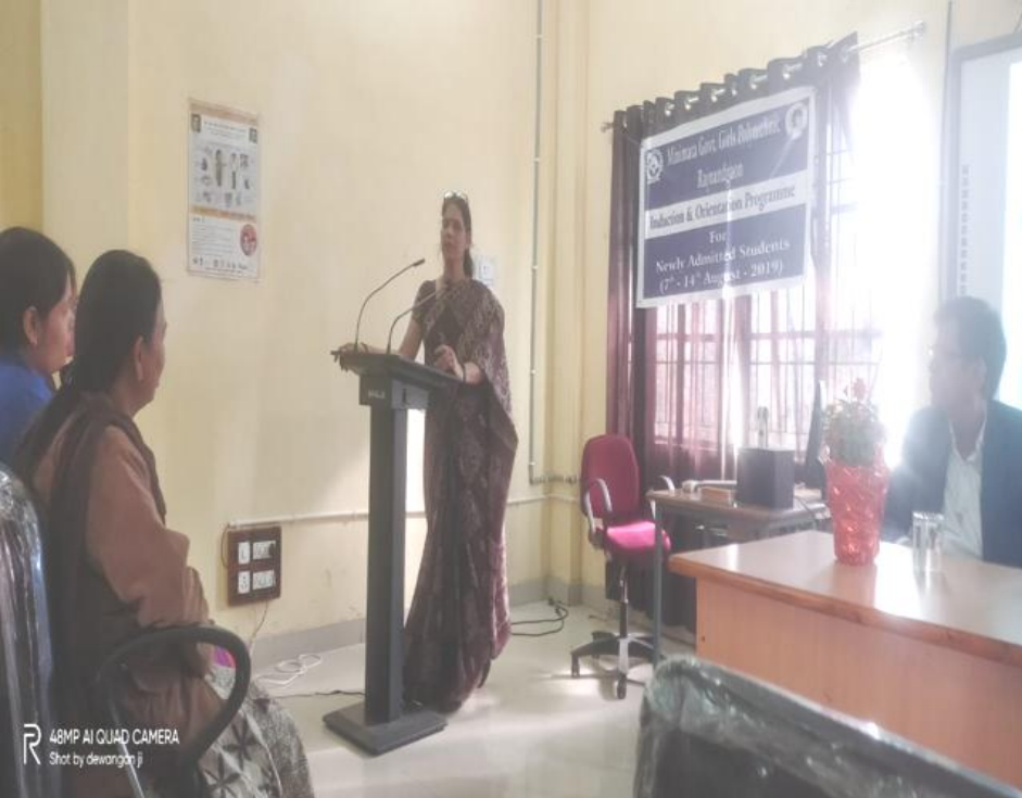
48MP AI QUAD CAMERA