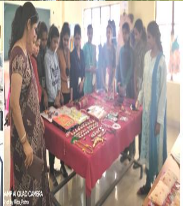
48MP AI QUAD CAMERA