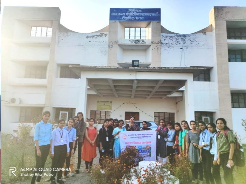
64MP AI QUAD CAMERA