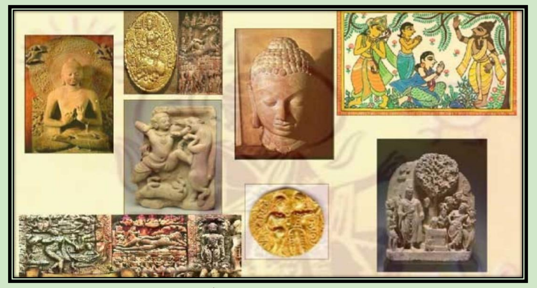
WEL COME TO DEPARTMENT OF HISTORY